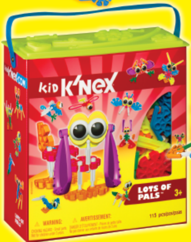
LOT OF PALS™