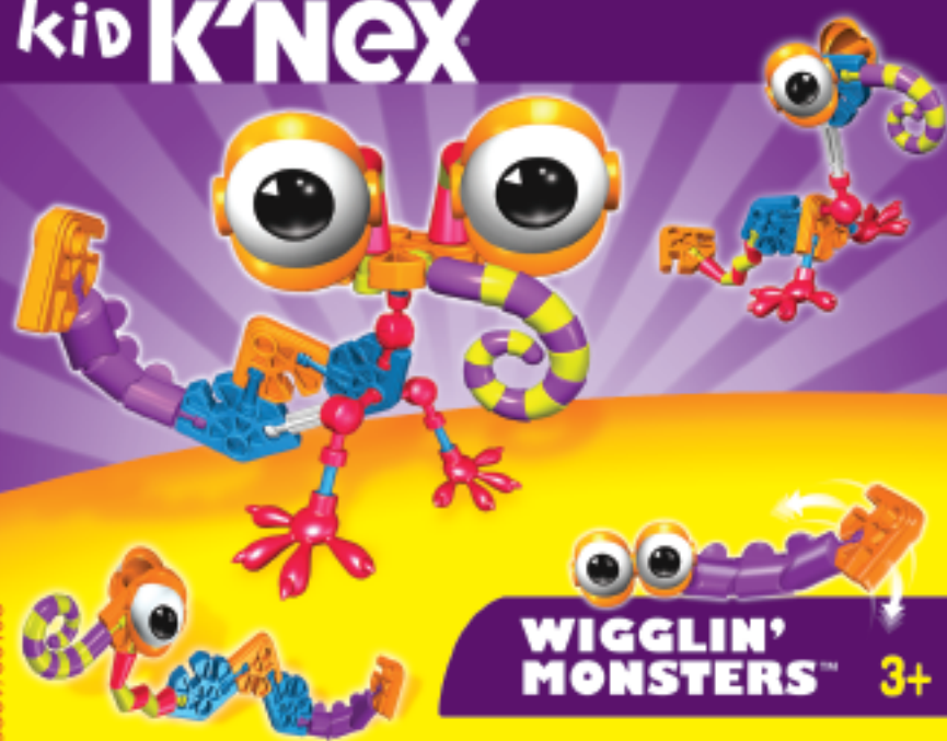
WIGGLIN' MONSTERS™ 3+